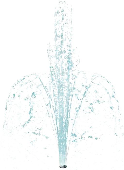
See Specification Sheet for product data.

Cluster ground sprays together to create exciting water experiences for users of all abilities. Ground sprays are a perfect addition to any play zone and create natural gathering areas for exploration and communal play.